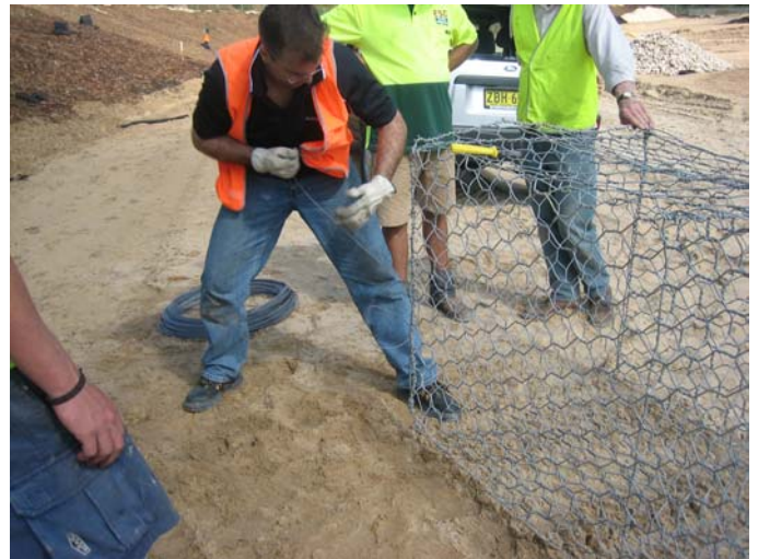
On-Site Installation Training