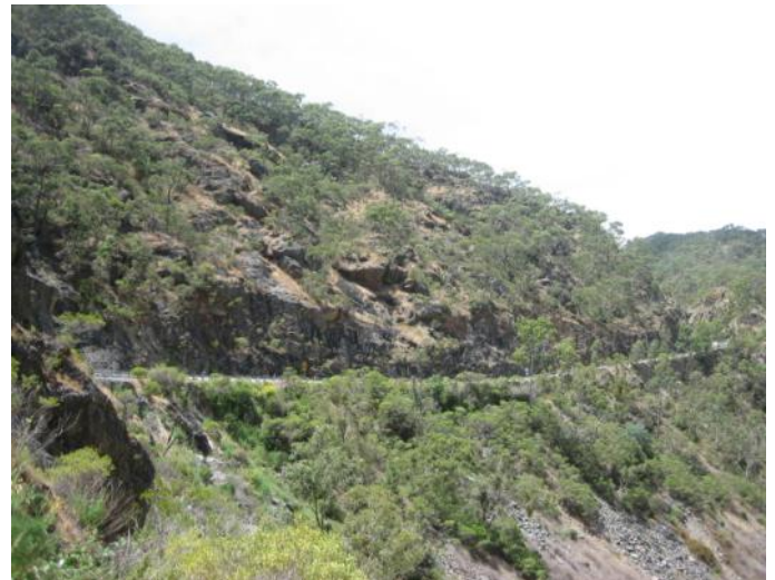
Gorge Road Cutting