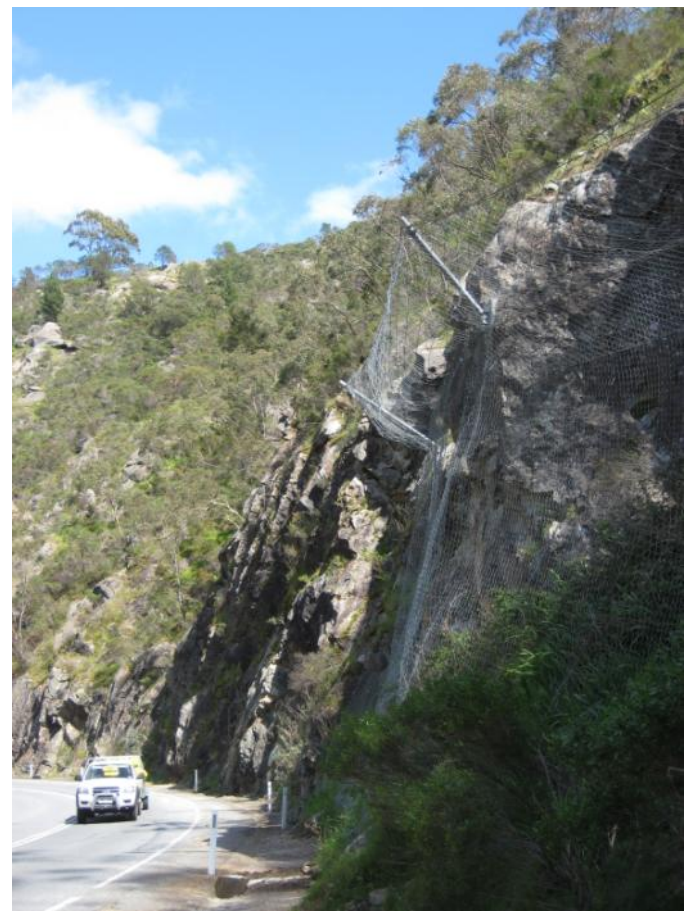
Completed Barrier Protecting Motorists