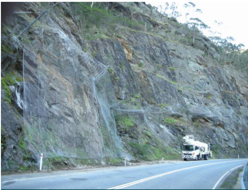
Soon After Completion