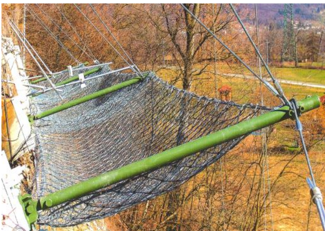
Crash Test Site (ETAG 027)

The specifications and location for the barrier and site supervision were provided by Rocktest Consulting. The complex construction work was carried out using boom lifts and roped access techniques by Retaining Wall Solutions in only three days once the drilling was completed.