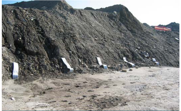
Nylex Stripdrain 300 for sub-surface drainage

The project was completed in 2005 with local residents to benefit from the converted waste tip.