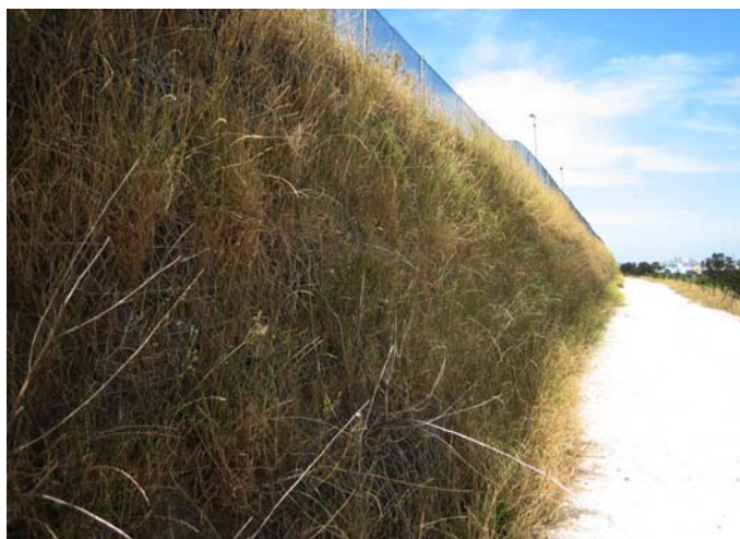
Green Terramesh totally revegetated