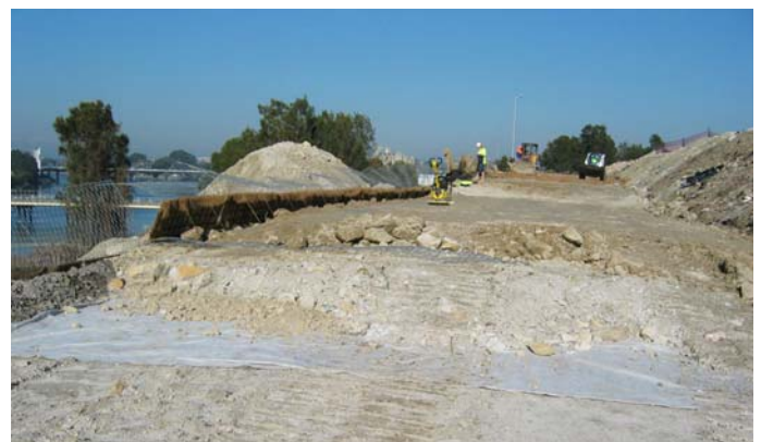
Rock PEC geotextile composite basal reinforcement