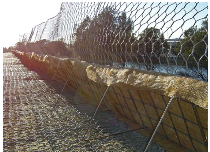
Green Terramesh units with pre-formed angle & BioMac