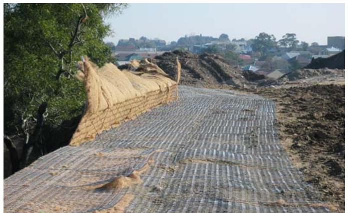
Green Terramesh integral tails (pre-determined lengths)