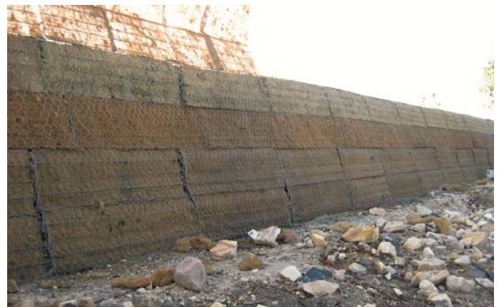
Green Terramesh facing (unvegetated)